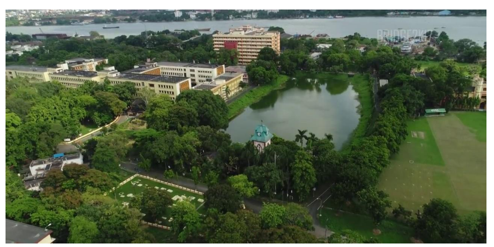
Main Academic and Acharya SN Bose Building

The Institute has a beautiful green campus covering an area of about 49 hectares situated on the bank of the river Hooghly. It is located next to the AJC Bose Indian Botanical Garden and opposite to the Kolkata Port. The campus has a number of academic and administrative buildings, library, accommodations for staffs and students, guest house, auditorium, swimming pool, students' amenities, banks, school, hospitals and general services.